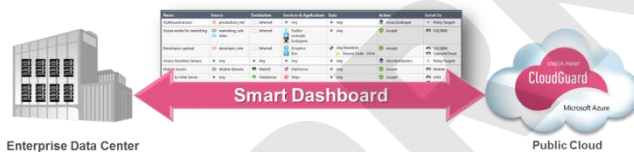
The Check Point Smart Dashboard provides real-time visibility into activity that spans the data center to the Azure hybrid cloud.

level of protection is applied consistently across both hybrid cloud and physical networks. Hybrid cloud workload traffic is logged and can be easily viewed within the same dashboard as other logs. Deploying Azure infrastructure services on-premises with Azure Stack enables management consistency and workload compatibility across both private and public cloud infrastructures, creating a single Azure hybrid cloud.